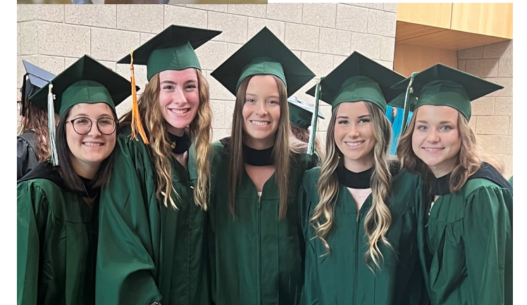
The Class of 2022 celebrated an in-person Commencement on May 24, 2022.