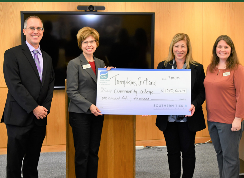
Southern Tier 8 presenting grant to expand microcredential offerings