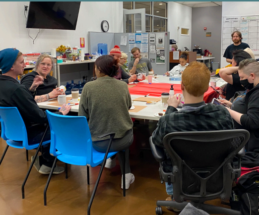
Students in the Best Life Lounge

The College has long recognized that success in the classroom is influenced by our students' lives beyond the classroom. Through the work of many offices on campus, and the TC3 Foundation, support and assistance is provided when students face barriers and challenges. At the same time, the College is continuing the important work of providing our students the best possible experience.