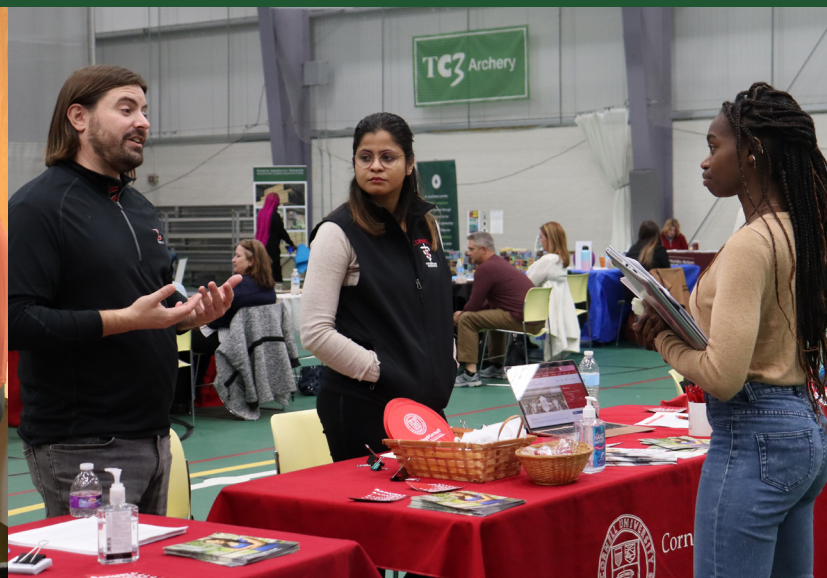
Job Fair held at Tompkins Cortland Community College